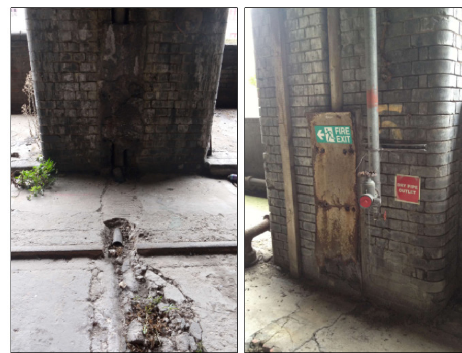
EXISTING DRAINAGE AND MAINS WATER PIPES - Redundant and to be removed. Please see M&E Engineers' Drawings for above ground drainage strategy, and Structural Engineers' drawings for below ground drainage strategy.