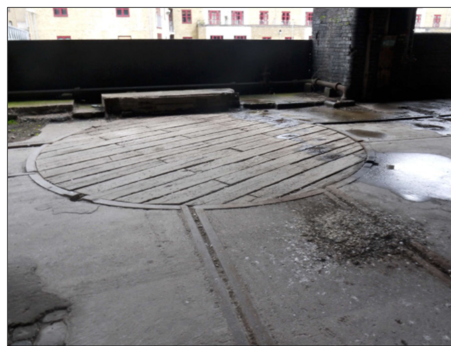
EXISTING FEATURES ON LONDON ROAD - To be lifted and redistributed as part of the site wide Landscaping Strategy, please see Spacehub Drawings