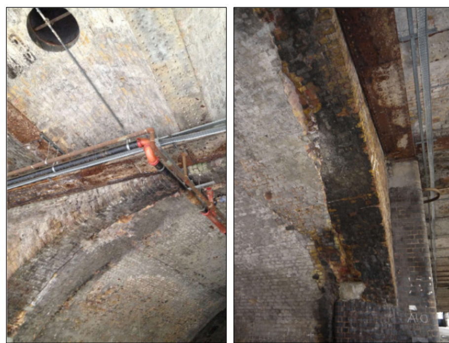
REPAIRS REQUIRED TO BRICK VAULTS & JACK ARCHES - Includes replacement of badly spalled or missing bricks & new slab over jack arches. Please see Structural Engineers report & drawings.