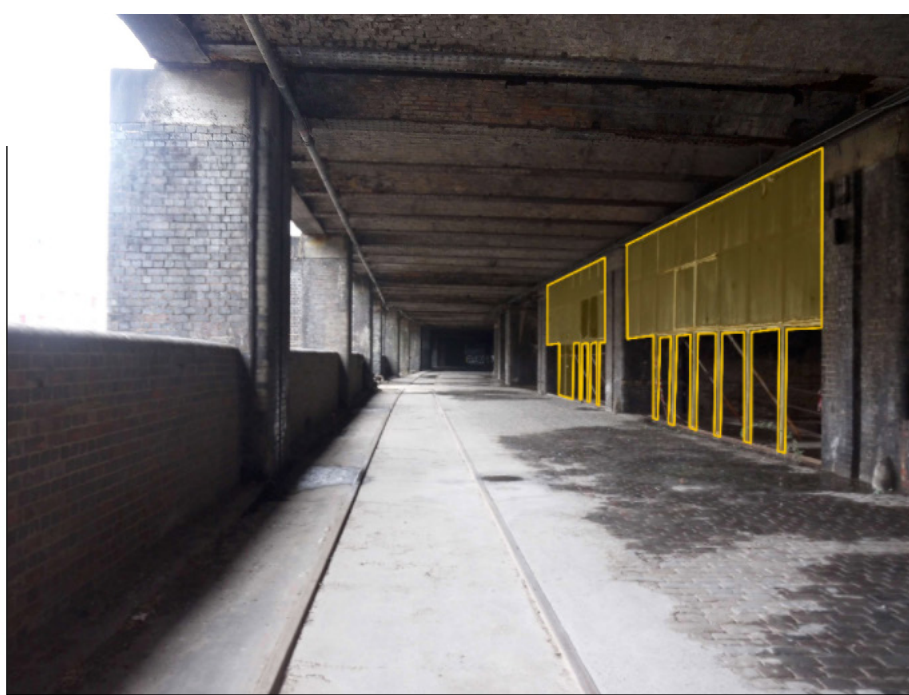
EXISTING SHOP FRONTS AND INTERVENTIONS IN FRONT OF ARCHES - To be removed ready to receive new shop fronts. Brickwork to be sensitively repaired to preserve the patina that characterises London Road. Proposed demolitions highlighted in yellow.